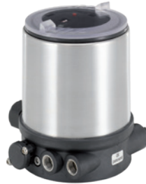
Valve assembled with Positioner 024.16.710